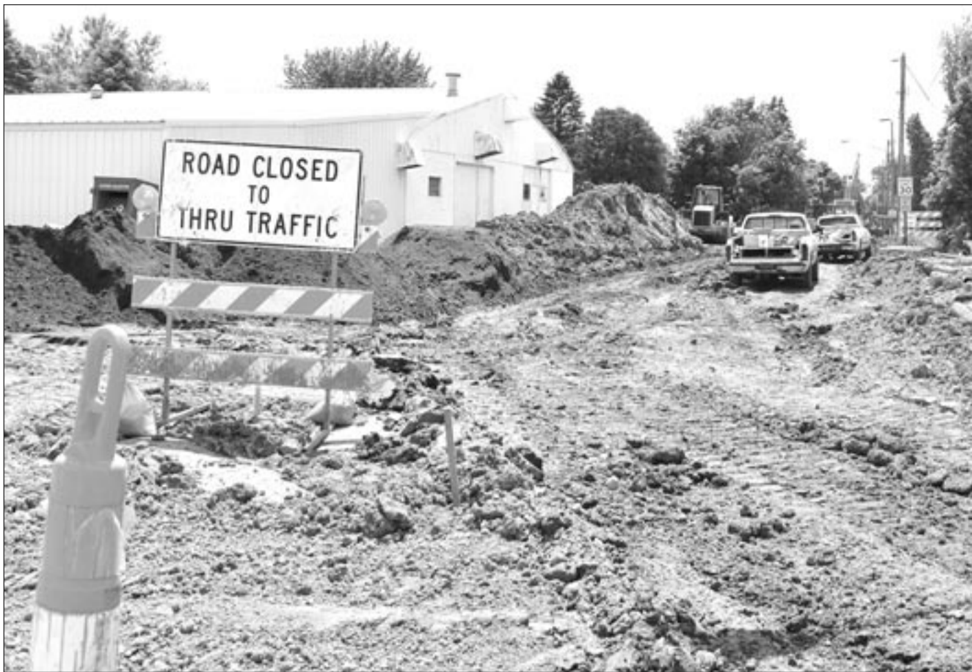
The reconstruction of Grove Avenue was a lengthy process in Silver Lake for the year 2013. Crews began work on the road beginning in May, and finished most

work in November of this year. Final adjustments and tasks are set to be completed spring of 2014.