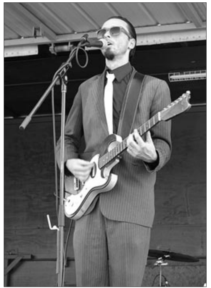
The first annual Bikes-n-Blues event was held this past August in the softball field near the pool in Silver Lake. The event was free and open to the public, and featured bands from Minneapolis, including Crankshaft, above.

work in November of this year. Final adjustments and tasks are set to be completed spring of 2014.