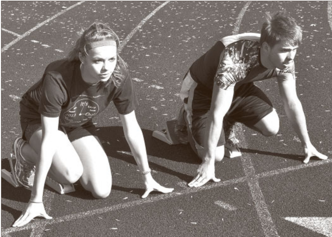
Enterprise photo by Kurt Menk