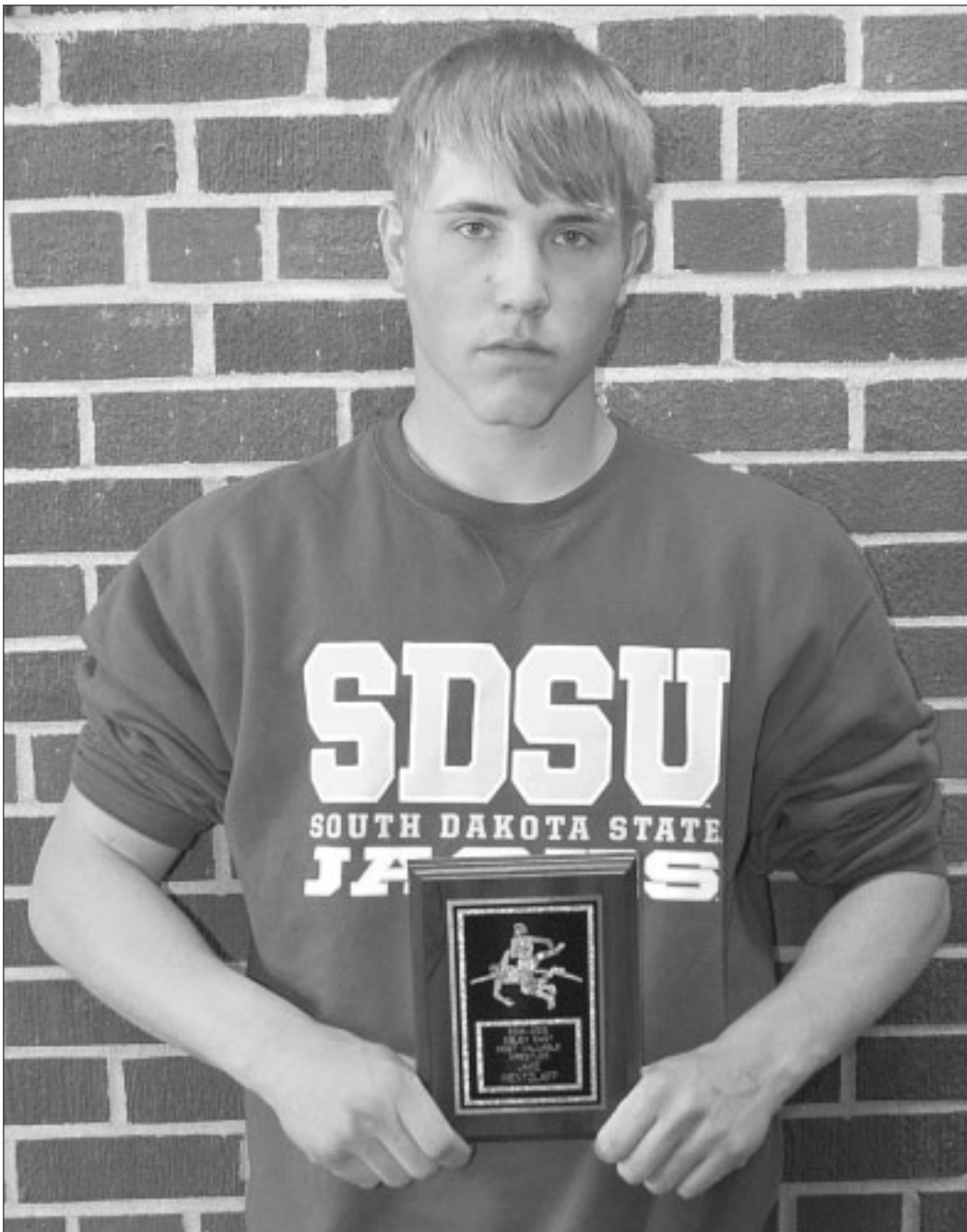
Enterprise