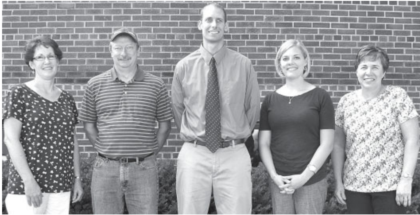
Enterprise photo by Kurt Menk