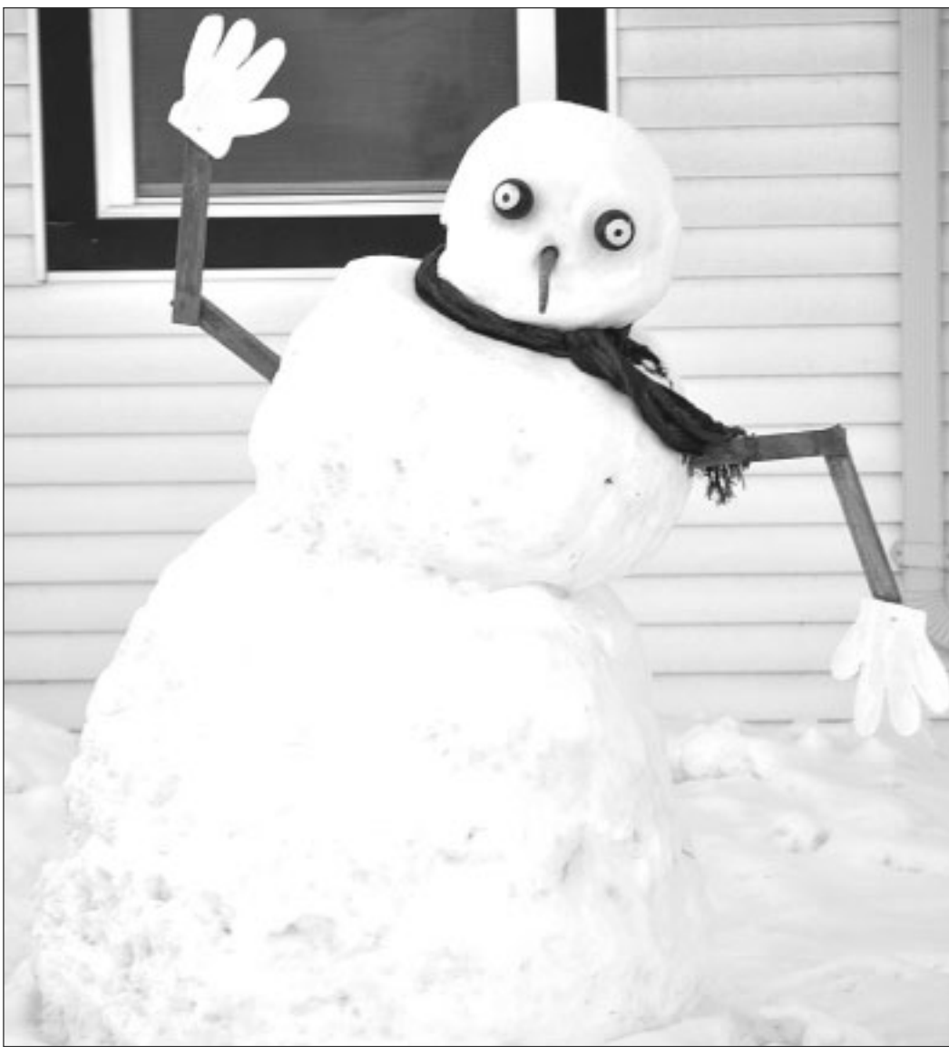
Enterprise photo by Kurt Menk