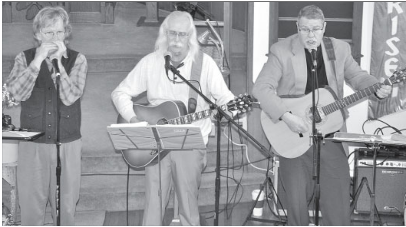
Enterprise photo by Kurt Menk