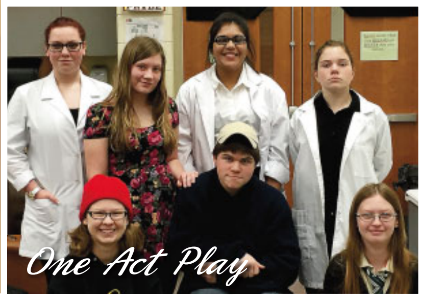
One Act Play