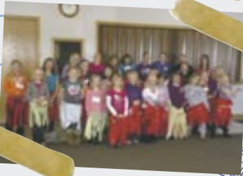
Girl Scout Thinking Day February 23, 2013

31 girls attended Thinking Day and learned about several countries, along with participating in games, crafts, etc. from Venezuela, Belgium, Holland, Ireland and Hawaii.