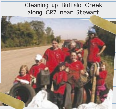
Cleaning up Buffalo Creek along CR7 near Stewart Stewart-Brownton Girl Scouts Crow River Clean-Up

I will do my best to be honest and fair, friendly and helpful, considerate and caring, courageous and strong, and responsible for what I say and do, and to respect myself and others, respect authority, use resources wisely, make the world a better place, and be a sister to every Girl Scout.