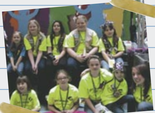
Stewart-Brownton Girl Scouts Great Girl Gathering @ MOA