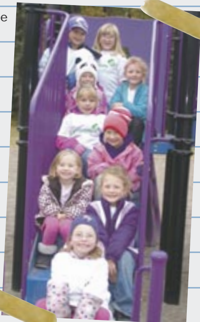
Glencoe Daisy Troops Centennial Day of Service October 13, 2012