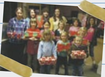
21 packages for Operation Christmas Child Stewart-Brownton Girl Scouts Operation Christmas Child