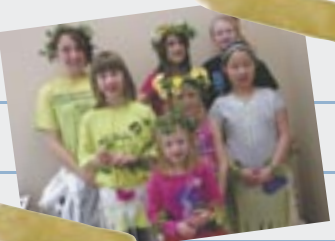
Stewart-Brownton Girls' Overnighter Hawaii Thinking Day

31 girls attended Thinking Day and learned about several countries, along with participating in games, crafts, etc. from Venezuela, Belgium, Holland, Ireland and Hawaii.